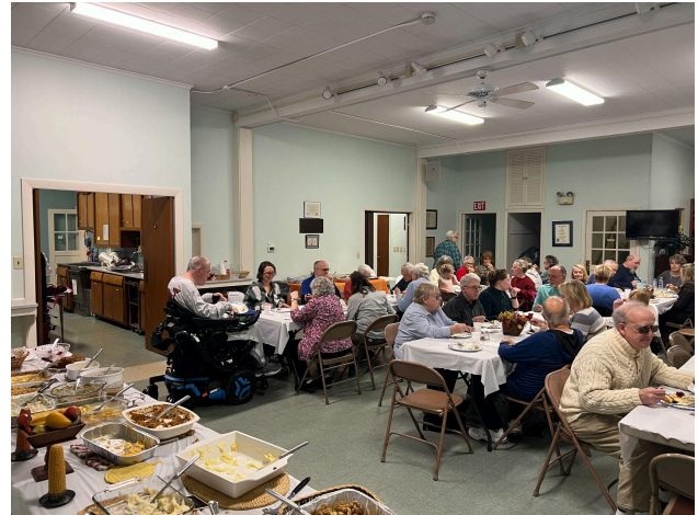
Potluck Dinner in Hunt Hall

People show up early for Bible study and stay late to chat. Twice a month we enjoy a coffee hour, often with a potluck-style lunch. New-comers will find a welcoming reception with a friendly greeting and at our traditional service.