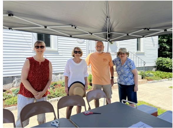
East Lyme Day