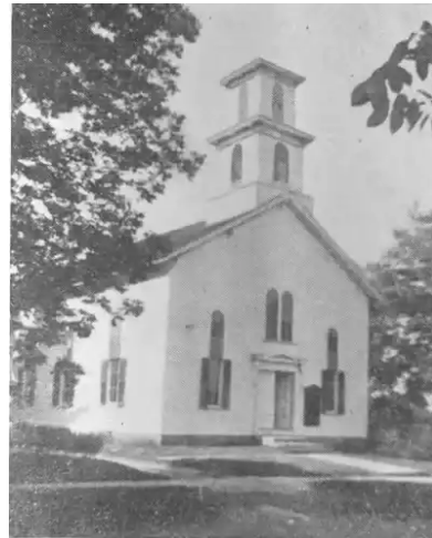
NBC prior to 1938