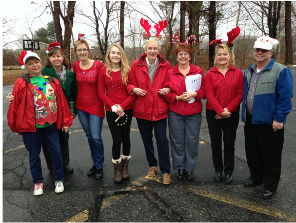
Christmas Carol Sing