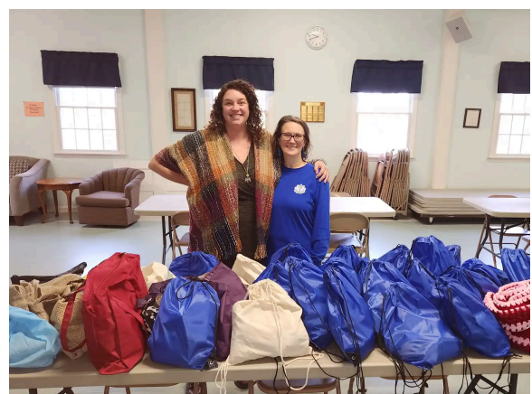
Care packages for Reliance House