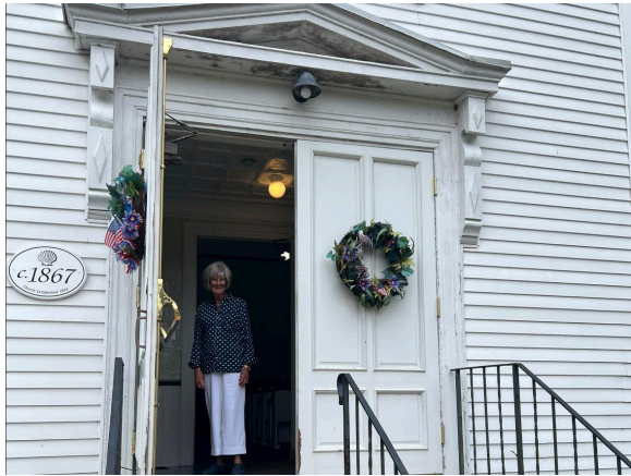
Welcome to NBC