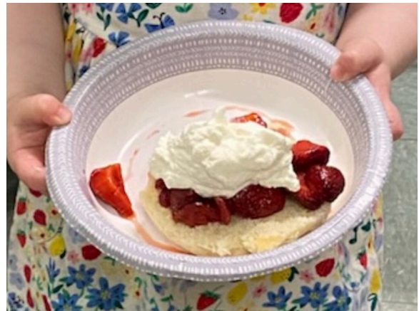
Annual strawberry-shortcake festival