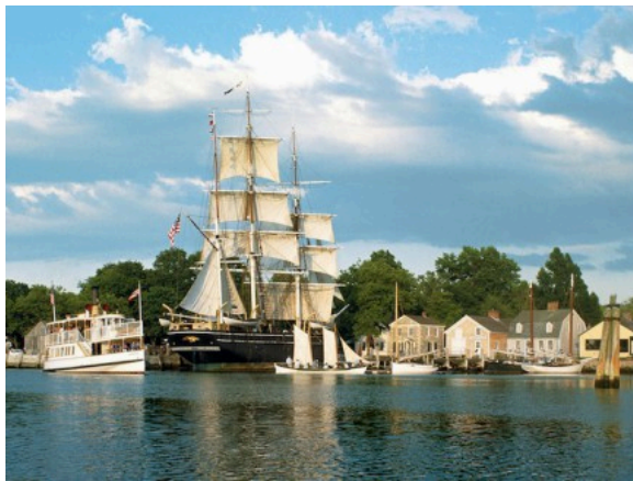
Local Mystic Seaport Museum