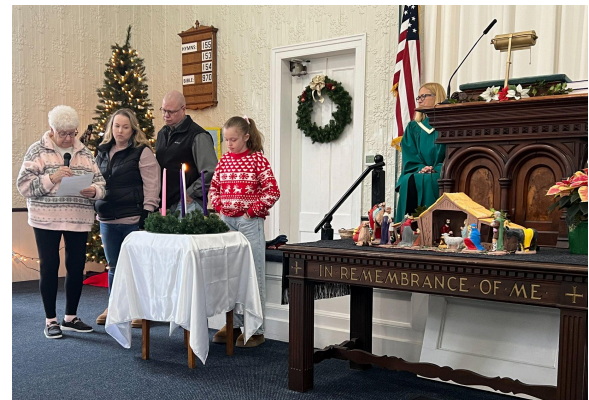
Lighting the Advent Candles

Our church values tradition and celebrates our long history in Niantic. Our community and connection is strengthened by a traditional order of worship and events throughout the liturgical calendar, such as Maundy Thursday, international communion Sunday, and Christmas Eve. We value the many fellowship events such as summer picnics, Thanksgiving dinner, and giving out cocoa and cookies during the town's annual Light Parade.