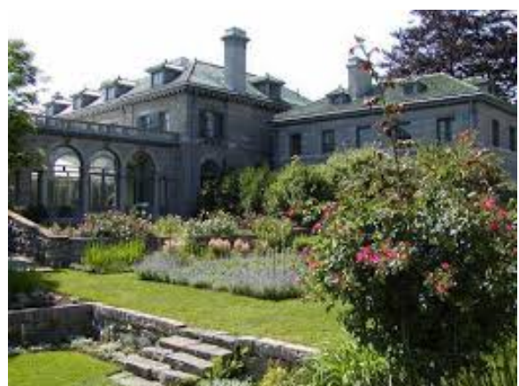
Harkness State Park