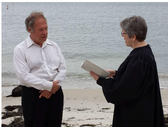
Baptism at McCook Point Beach